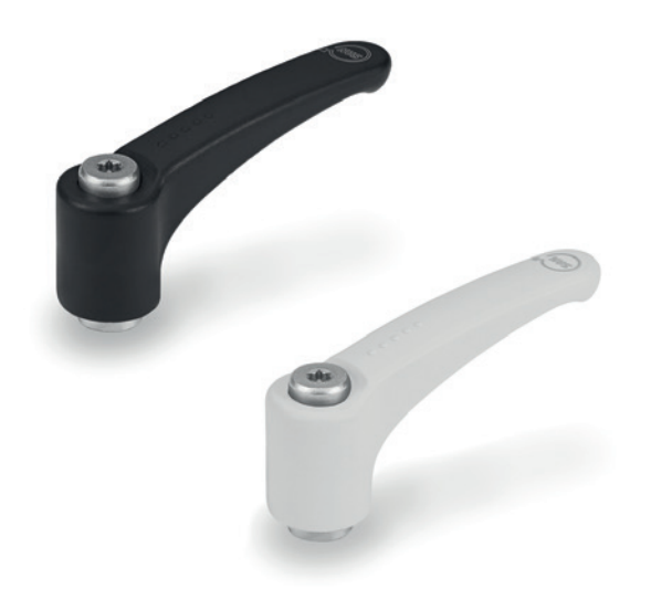
ERGOSTYLE® ELESA Original design